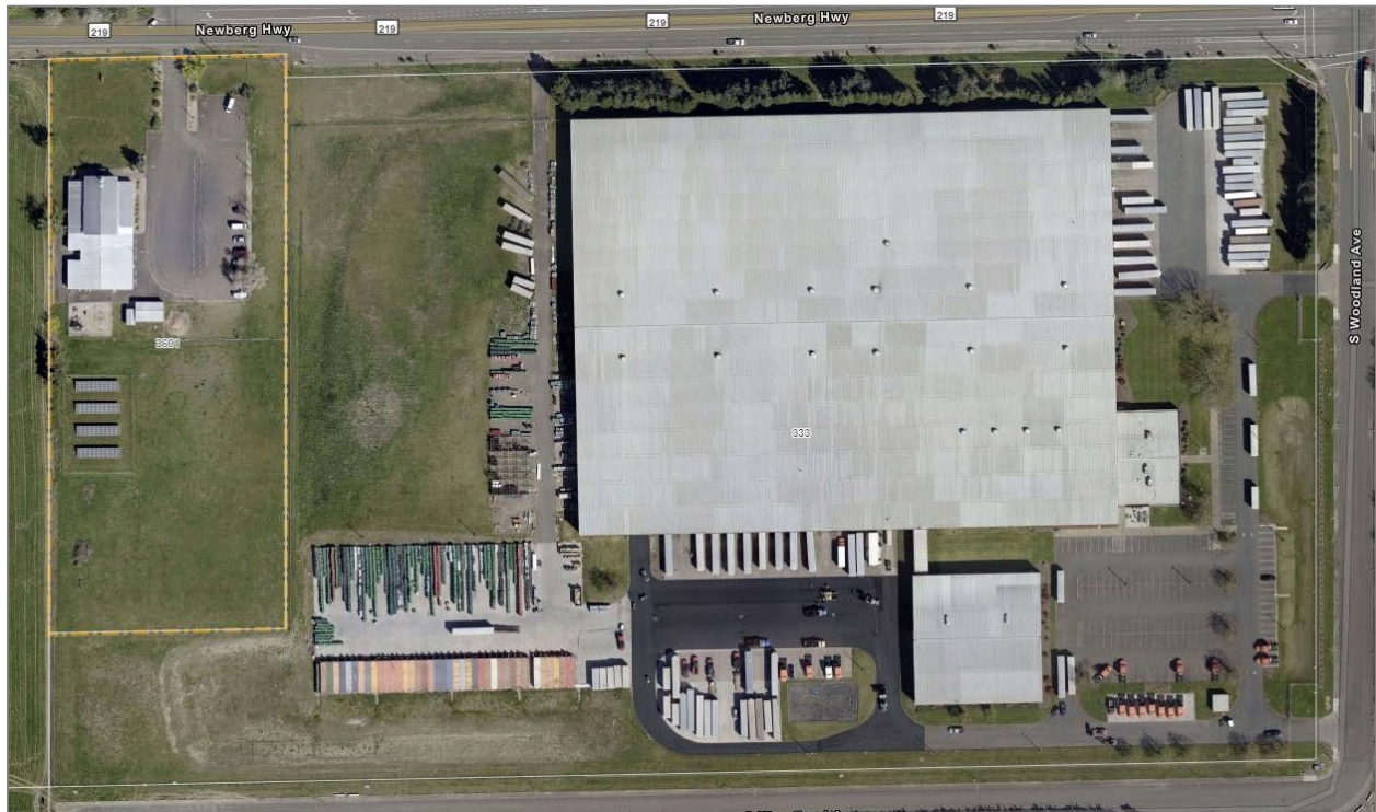
Aerial view of the site as it exists today.

Staff added conditions of approval to preserve several trees on site and fill in the gap in the tree line along Newberg Hwy / OR 219.