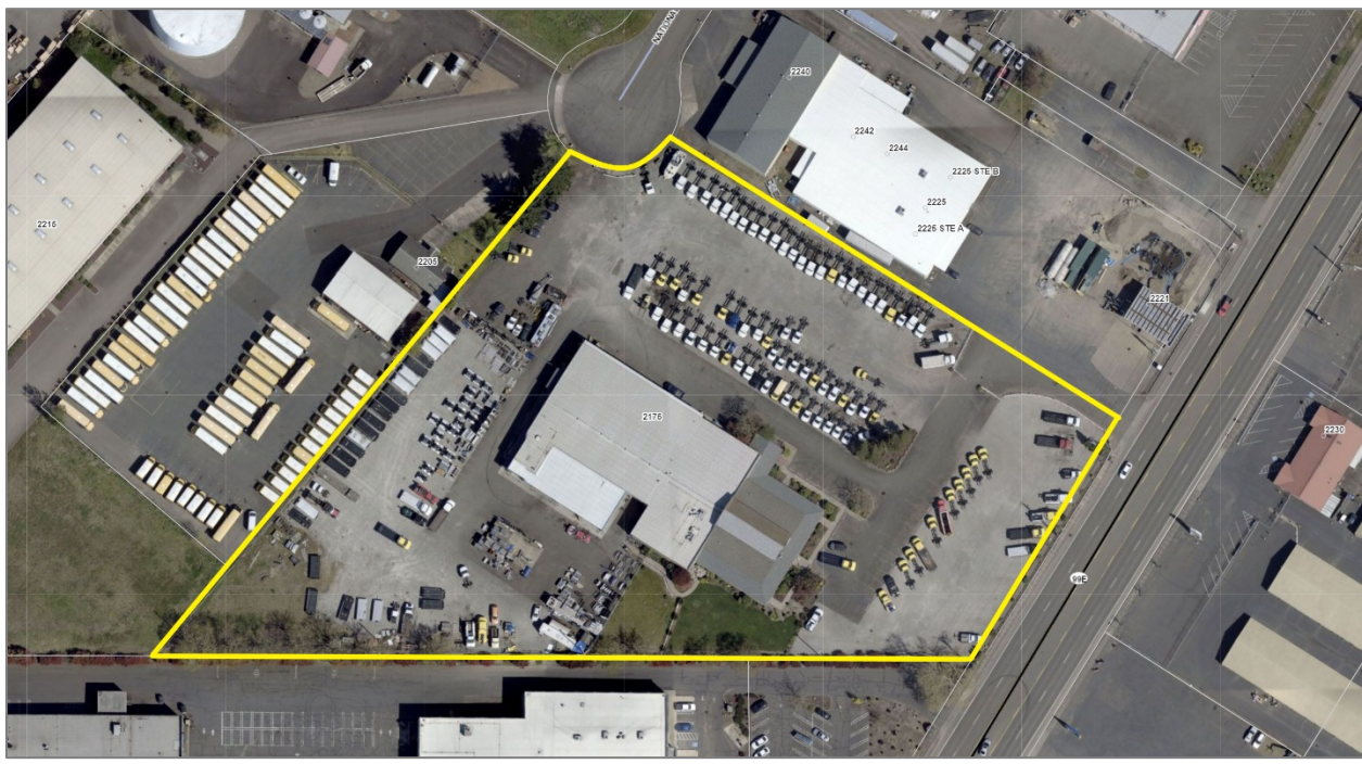
Aerial view of the subject property (outlined in yellow)

in-lieu is calculated and when it gets applied, the Commission voted 3-2 to maintain the burial requirement but modify the fee-in-lieu to align with recent precedent set by the Chick-fil-A project (DR 22-26). No testimony was received by proponents or opponents.