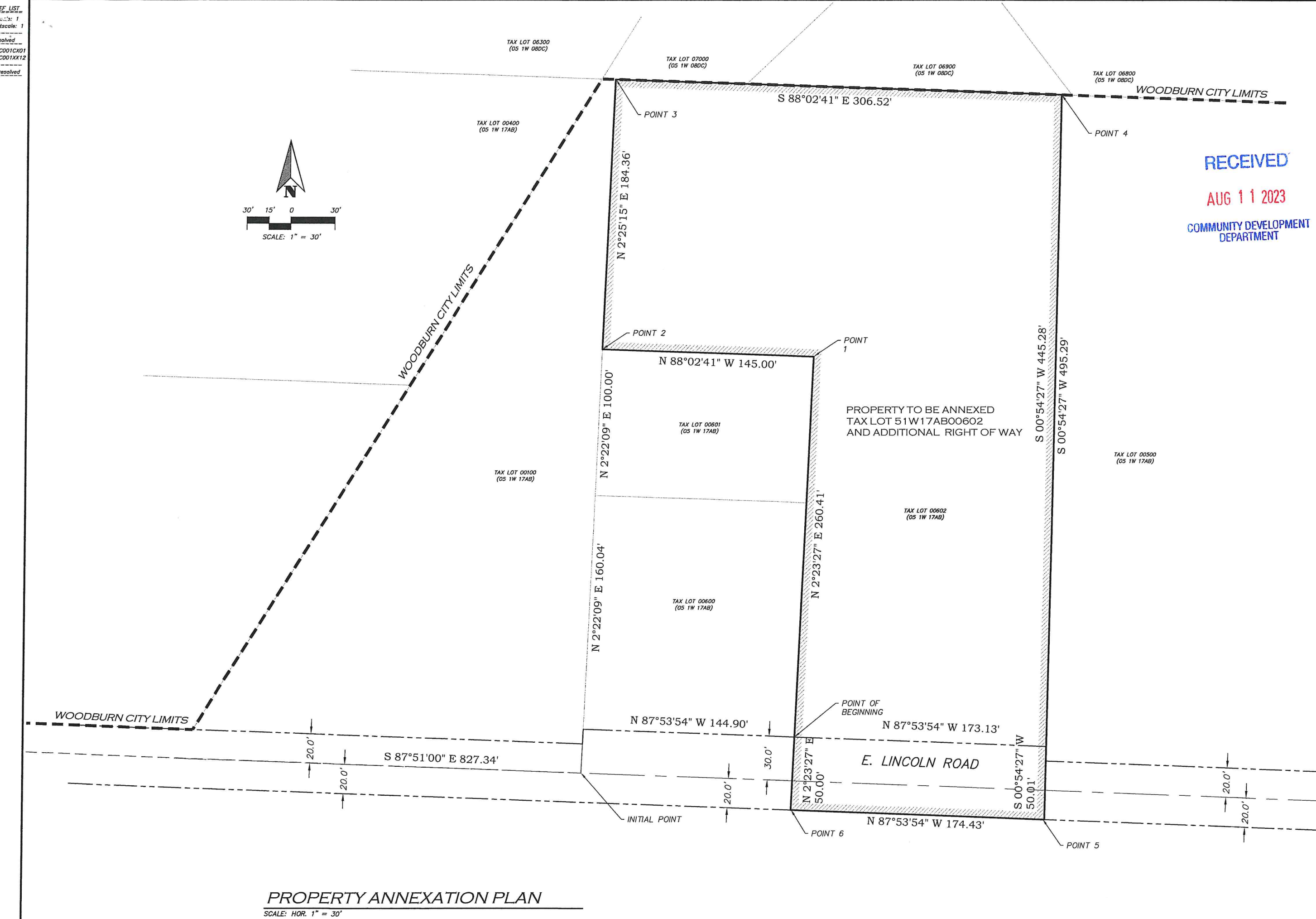
PROPERTY ANNEXATION PLAN SCALE: HOR. 1" = 30'

REF LIST Issue: 1 Scale: 1 Resolved GPC001CX01 GPC001XX12 Inresolved