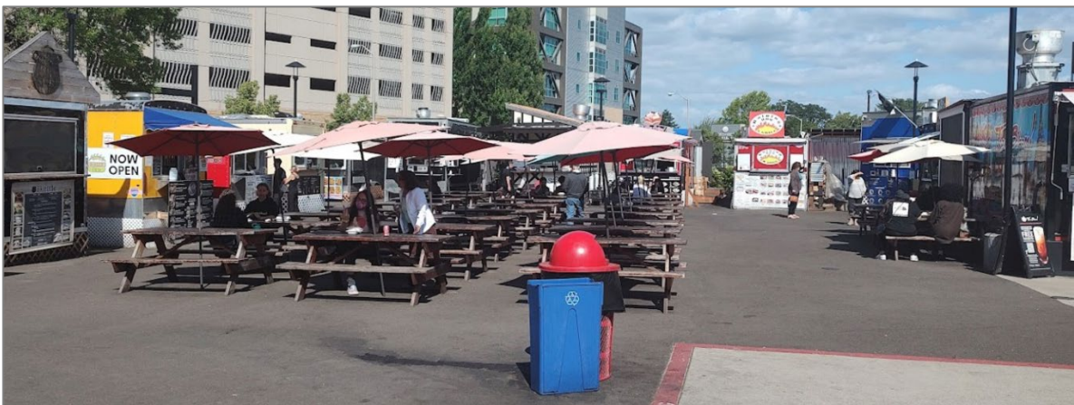
BGs Food Cartel in Beaverton