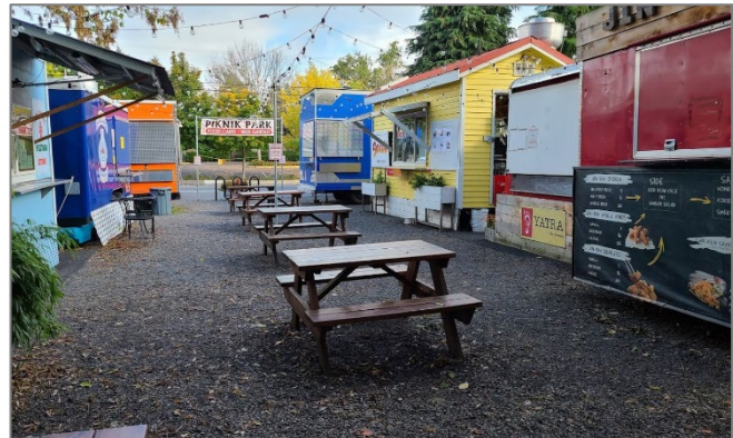
Piknik Park in Portland