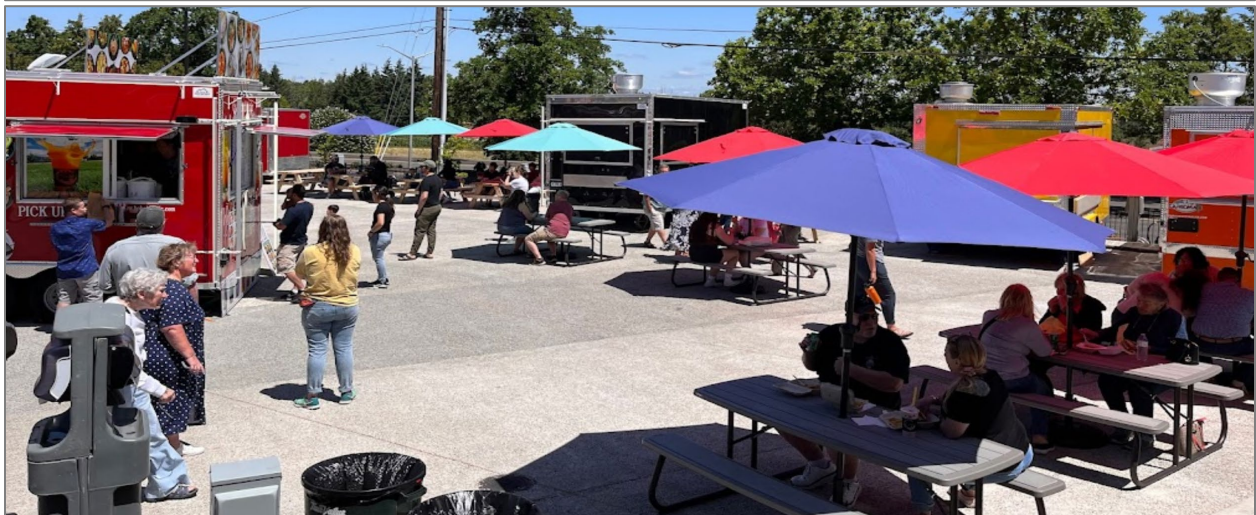
Checkpoint 221 in West Salem