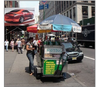
Examples of food carts

Food Cart Pod: A site containing space for three or more food carts and associated amenities (seating areas, restrooms, etc.) under common management on private property.